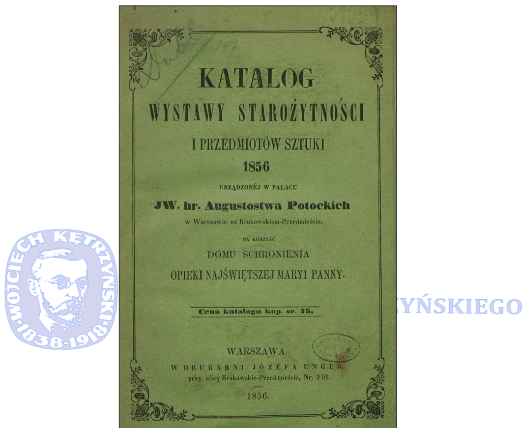
Fig. 1. Cover of Katalog wystawy starożytności i przedmiotów sztuki from 1856